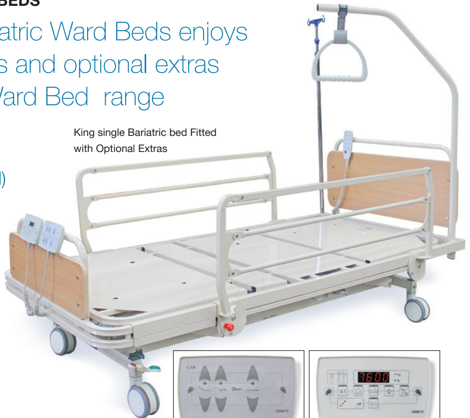
King single Bariatric bed Fitted with Optional Extras

OPTIONAL EXTRA: IN-BED WEIGH SCALES, SEE OTHER AVAILABLE OPTIONAL EXTRAS ON THE GENERAL WARD BEDS PAGE