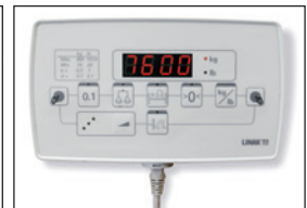
Optional Inbed weigh scales with Control Panel