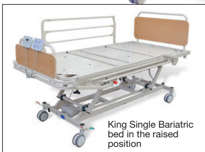
King Single Bariatric bed in the raised position