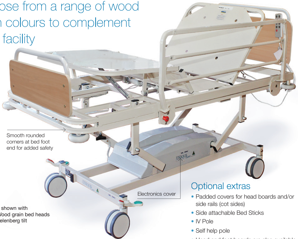
Ward Bed shown with optional Wood grain bed heads and Trendelenberg tilt

Choose from a range of wood grain colours to complement your facility