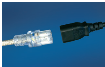
Break away cable