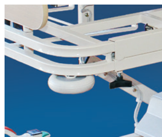
Extendable mattress base