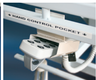
Optional hand control storage