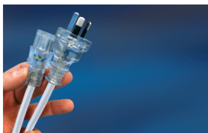
Anti flex coating on mains cable

Dewert electronics ensures the safety of your staff and residents.